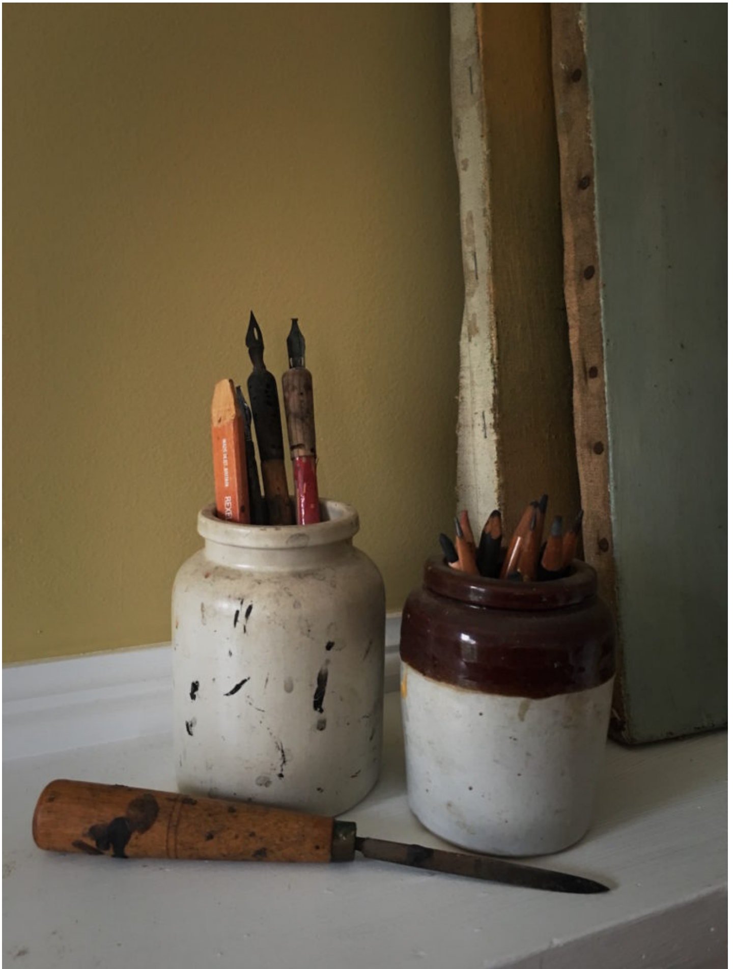
Detail of the room