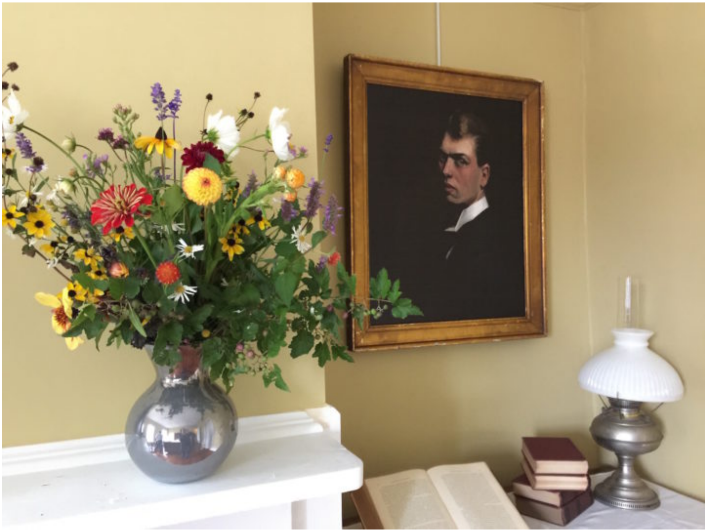
Edward Hopper's bedroom in his Nyack home