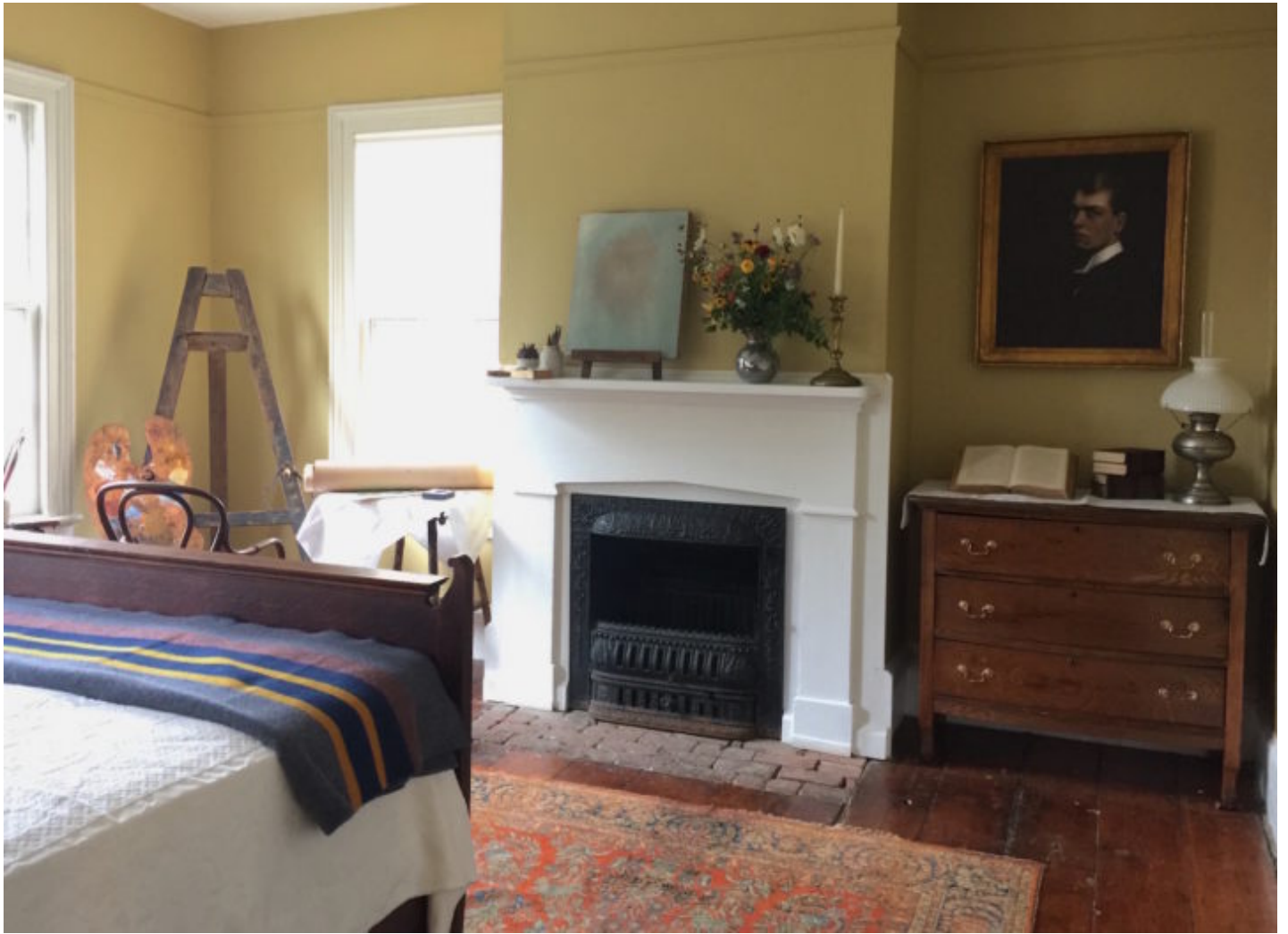
Edward Hopper's bedroom in his Nyack home