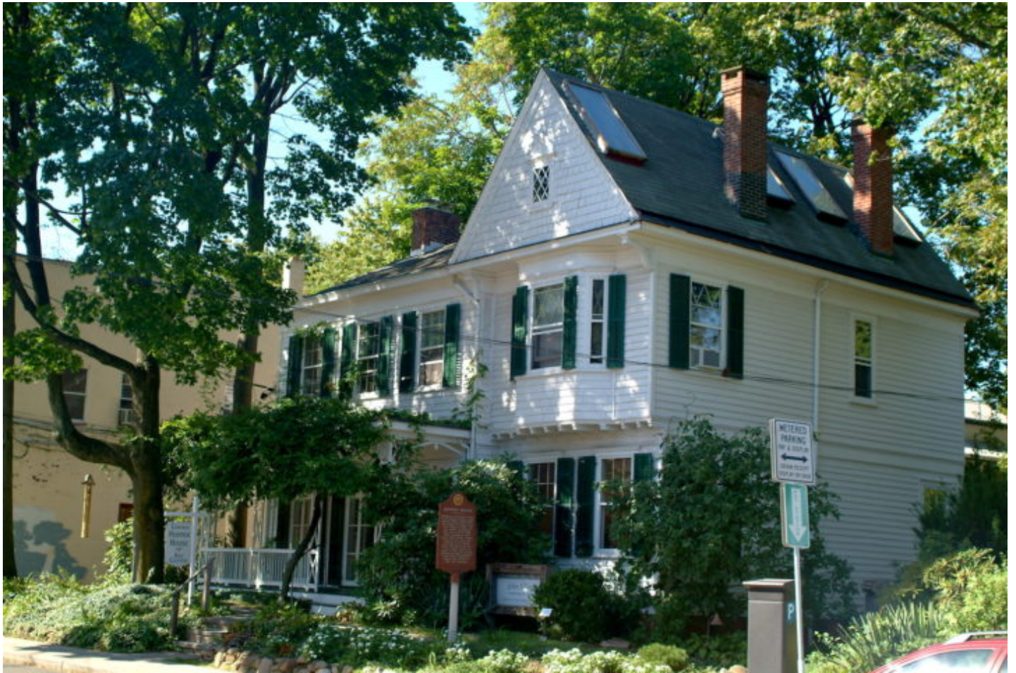
Edward Hopper's former house